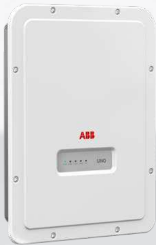
— UNO-DM-TL-PLUS-Q outdoor string inverter

UNO-DM-3.3/4.0/4.6/5.0-TL-PLUS-Q 3.3 to 5.0 kW